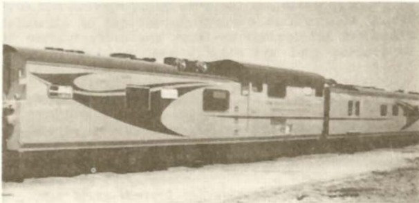
Fig. 2 Train Dynamics Instrumentation Vehicle