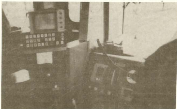
Fig. 4 CRT In Driving Cab